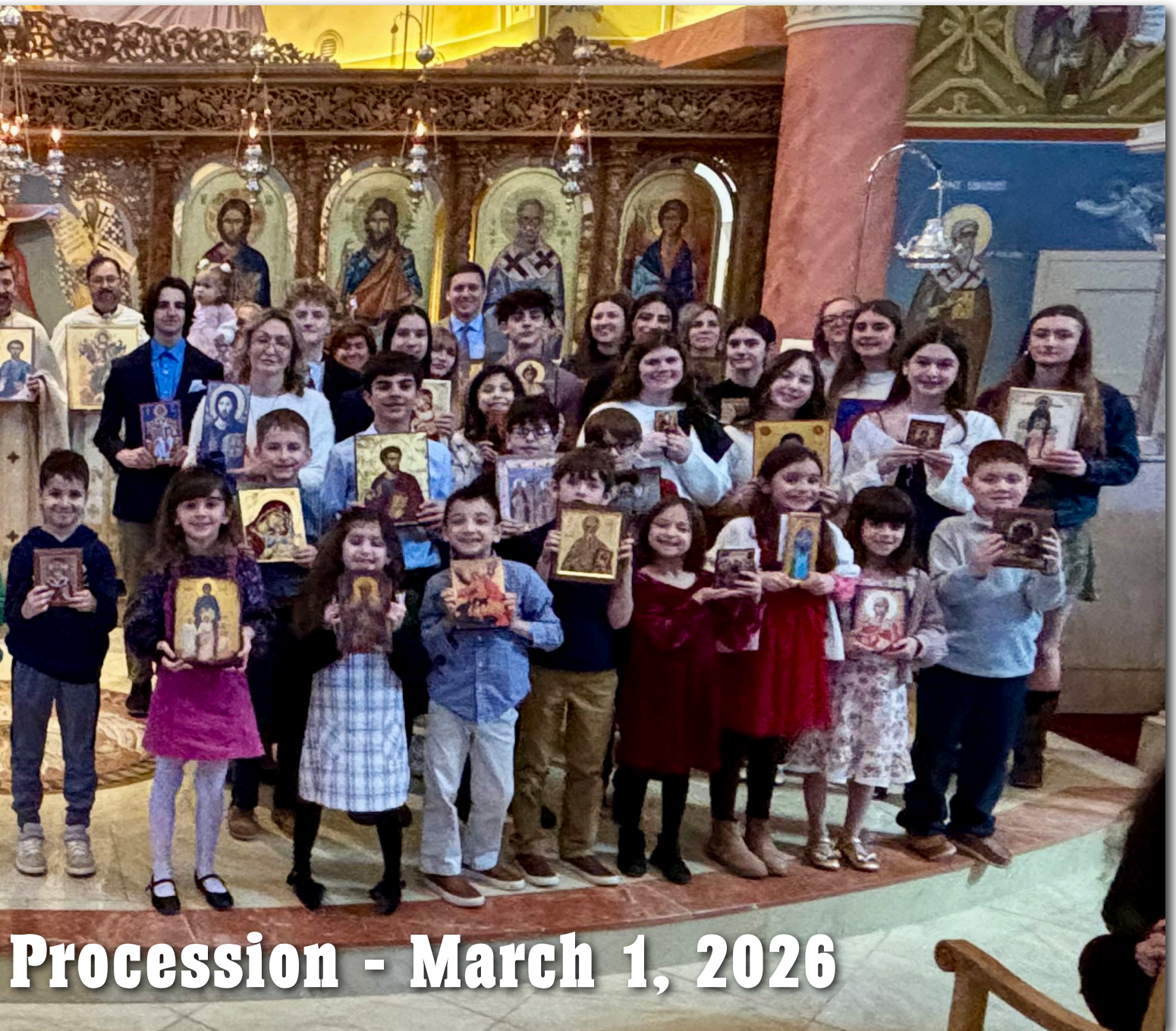
Procession - March 1, 2026