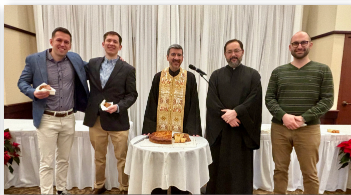
(January 4) Over 60 ministries and ministry leaders were honored at the annual Vasilopita Celebration following Divine Liturgy. Each Church School class was also provided with their own Vasilopita bread to celebrate it in their classroom with their teacher.