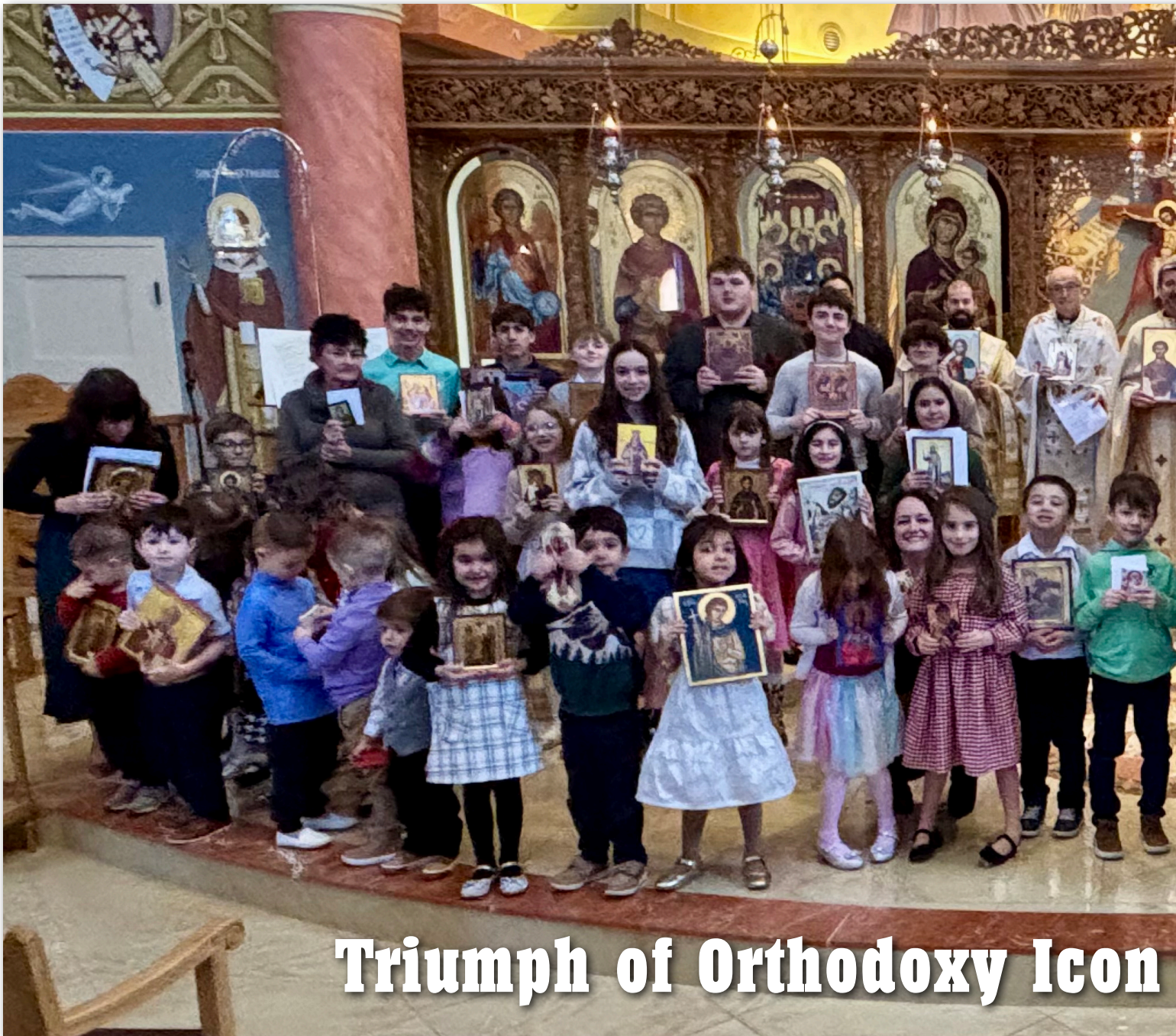
Triumph of Orthodoxy Icon